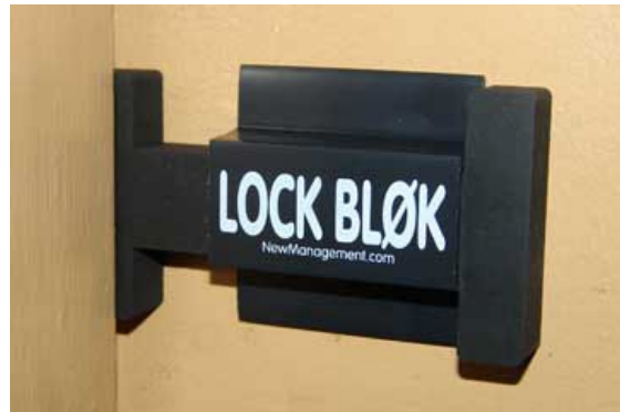
Slide pushed forward: Door ajar and locked.

The Department of Public Safety Office offers safe walk escorts whenever the College is open. Call 651.846.1322 or stop by the Public Safety Information Desk to arrange for an escort.