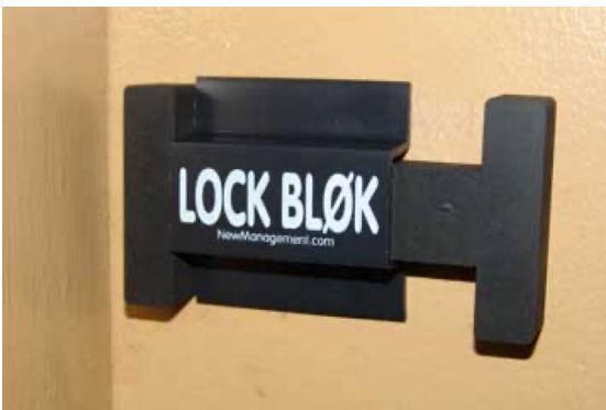
Slide pulled back: Door closed and locked.

Additionally, the Department of Public Safety has implemented Lock Blok devices on all classroom doors throughout the campus which allow for the ability to leave doors locked, but ajar for accessibility during class while also making it possible to quickly secure the door from the inside in the event of a lockdown situation.