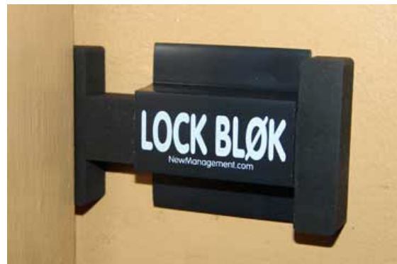
Slide pushed forward: Door ajar and locked.

The Department of Public Safety Office offers safe walk escorts whenever the College is open. Call 651.846.1322 or stop by the Public Safety Information Desk to arrange for an escort.